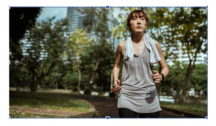
Image 1. Researchers are designing a device that uses sweat to generate power.

{f S} weat is the salty wetness your body makes to help keep cool. Now it might be one key to making electronics that